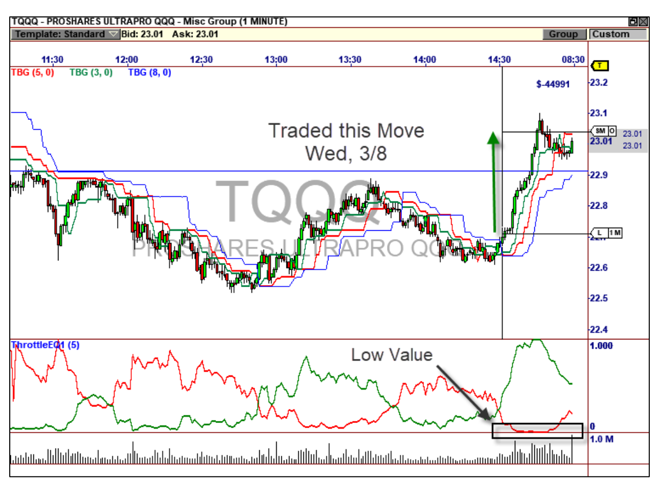
March 8 - Increasing Upper Leading Indicator with Lower Leading Indicator at a low value. 1 Min chart