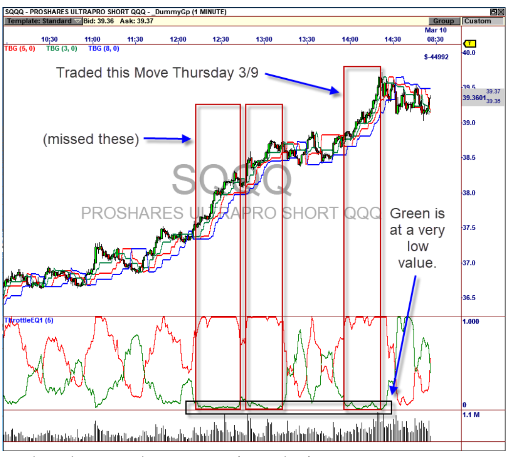
March 9 - Showing weak L.I. near zero. (1 Min chart)